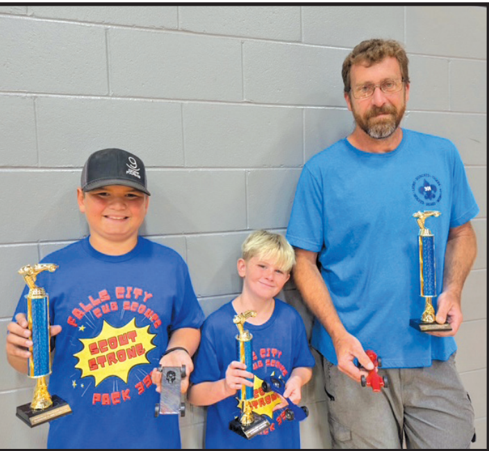
Pinewood Derby Contest Winners