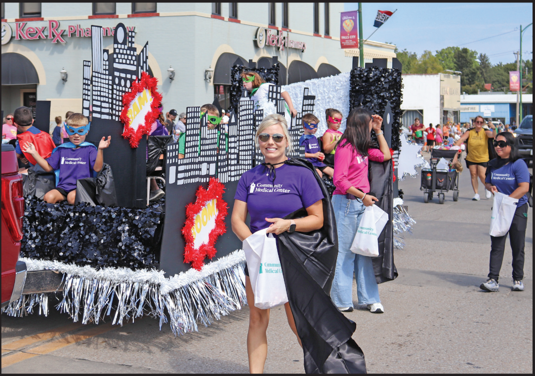
Business float winner: Community Medical Center.