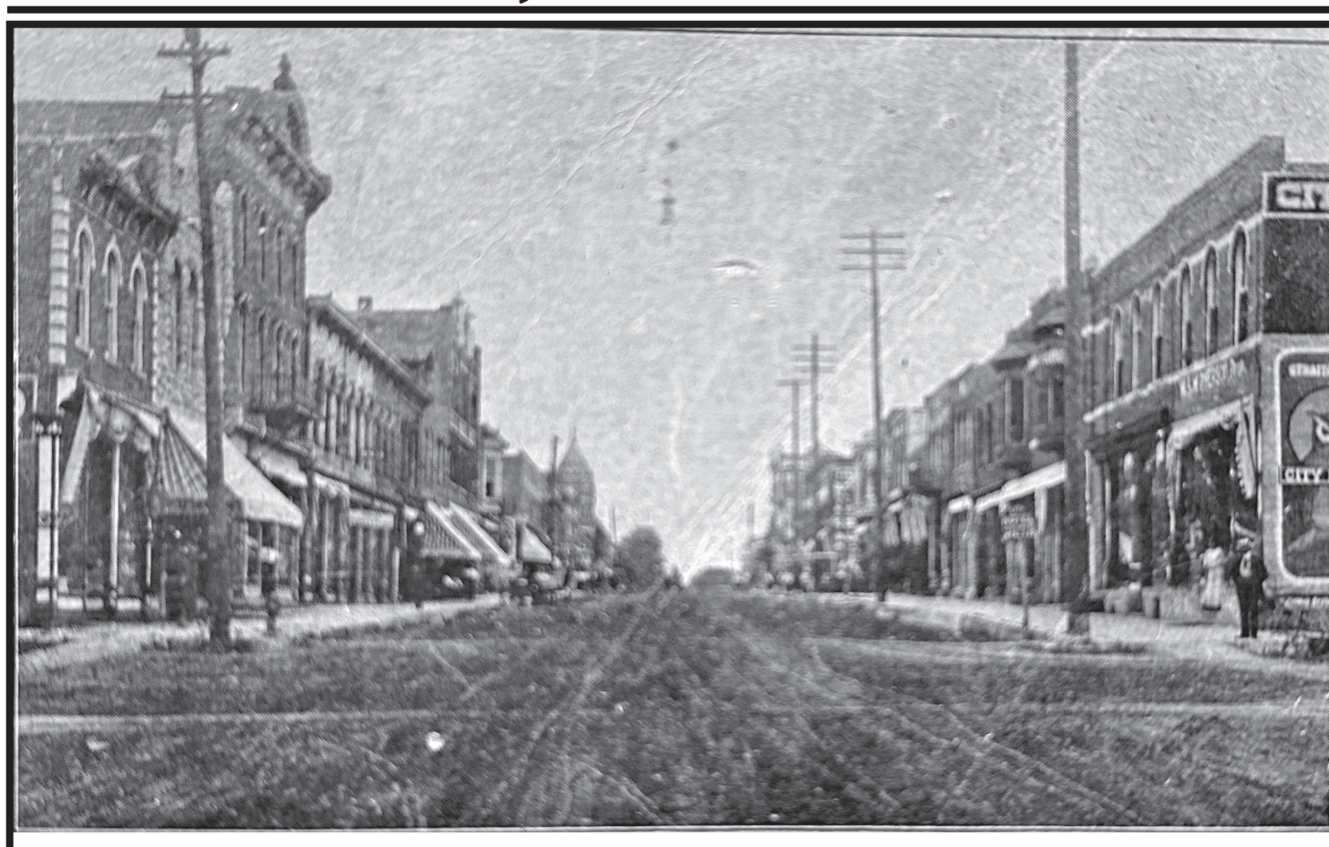
Stone Street in Falls City, Nebraska looking north in an undated photo.