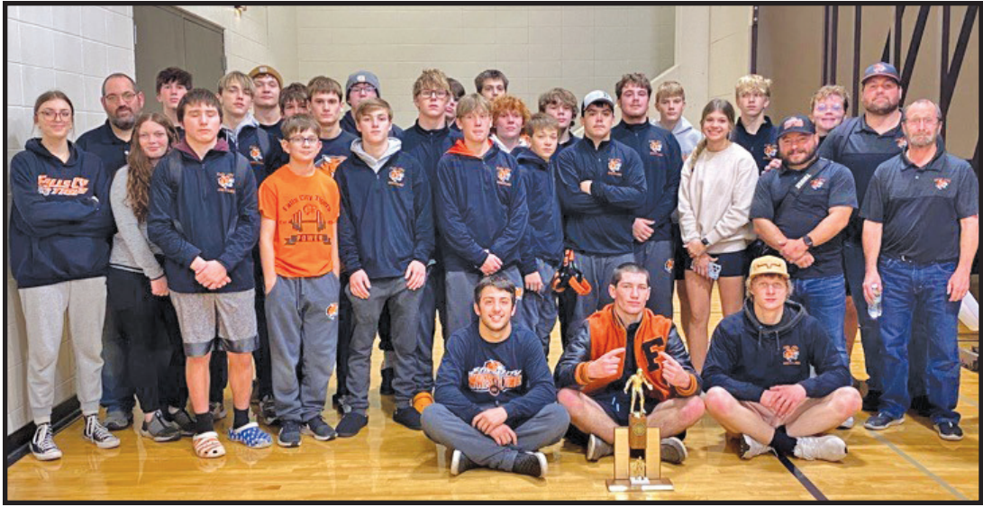
The Tiger wrestlers pose with their trophy from the tourney on Saturday at Omaha North.

Falls City travels to Johnson on Friday to take on the No. 1 rated team in Class D-1, the Johnson-Brock Eagles. The Eagles defeated Lincoln Christian 69-46 to open the season. On Saturday, December 9, FC will travel to Adams to take on the Freeman Falcons. Freeman was the No. 6 team in the Class C-2 preseason rankings. The Tigers will be at home for the first time when they host Elmwood-Murdock on Tuesday, December 12. The Knights are the No. 9 ranked team in the Class D-1 preseason polls.