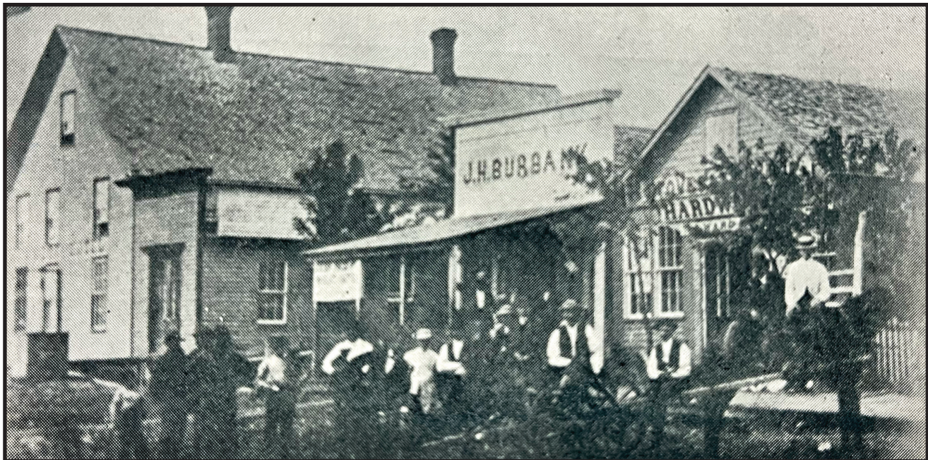
Falls City's first hotel, top left corner. It was put up the winter of 1857-1858.