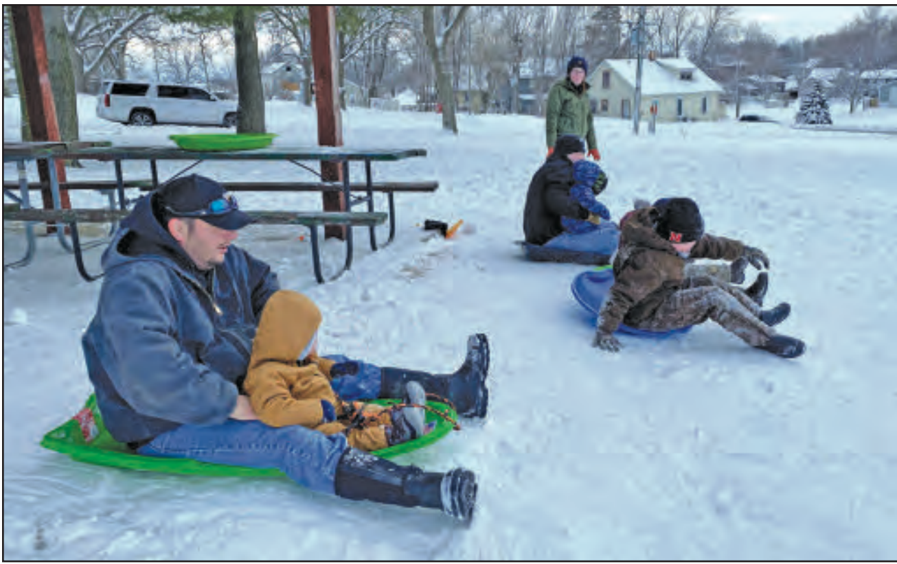
SNOW DAY: On Monday, January 25 and Tuesday, January 26, all Richardson County students received two snow days when Eastern Nebraska was blanketed in about four inches of snow with an additional few inches days later. Children of all ages took advantage of snow with sledding at Grandview Park in Falls City.