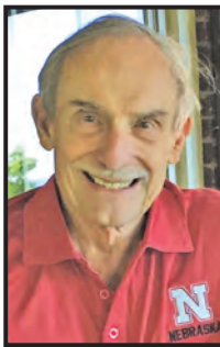
RICHARD SCHOCK PASSES AWAY DUE TO COVID RELATED PNEUMONIA

Nemaha County and Otoe County continued to see a massive jump in cases adding an additional 23 cases between Aug. 22 and Aug. 28.