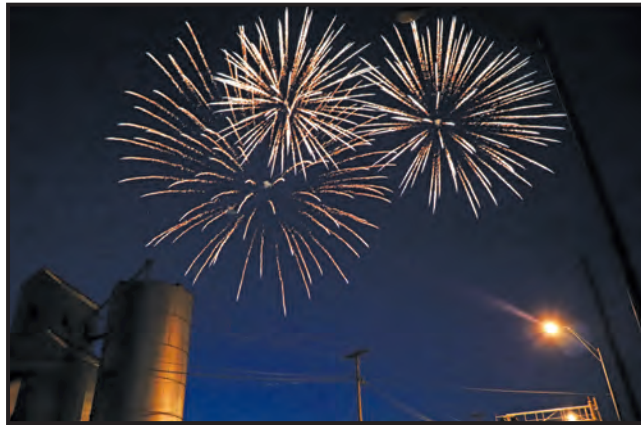
THE SHOW GOES ON - The City of Humboldt and the Humboldt Fire Department celebrated Independence Day with their annual fireworks show.