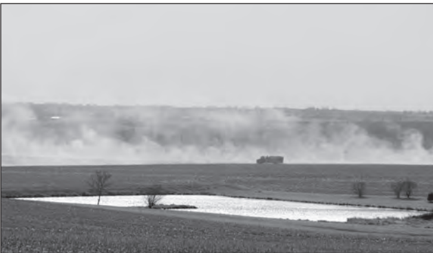
RED FLAG DAY: Last Thursday, a fire on the West edge of Falls City near 14th Street. The fire started in a field and jumped the road and then reached a residence where it destroyed a garage.