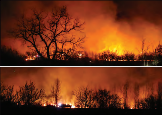
RED FLAG WARNINGS were issued for parts of Nebraska last week. Several local fires were called in between Thursday and Sunday including this Friday night fire on the southeast side of Rulo near the river. The glow of the fire could be seen from Falls City. A Red Flag Warning is: Three consecutive hours when relative humidity is less than 20 percent and winds are greater than 15 knots or frequent gusts over 25 MPH, or when there is greater than 15 percent coverage of dry lightning expected, may be not be available during the winter season.

In 2016, the Arago/Barada precinct became an All-Mail voting precinct and the voter turnout has increased as follows: 2014 Primary--31.52 percent; 2014 General--42.45 percent; Began All-Mail at 2016 Primary--55.12 percent (highest percent in County); 2016 General--82.63 percent (highest percent in County); 2018 Primary--41.39 percent (highest percent in County); 2018 General--71.84 percent (highest percent in County).