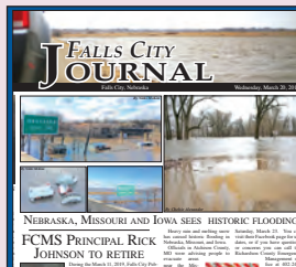
'Historic Flooding' Falls City Journal — March 20, 2019

On March 4, an estimated 300 people gathered at Prichard Auditorium in Falls City to recognize nearly 5,000 individuals belonging to one of four divisions of the U.S. Military. They had given the ultimate sacrifice for this country. The heroes were recognized at a ceremony for the National War Memorial titled, "Remembering Our Fallen," created by the non-profit organization, Patriotic Productions.