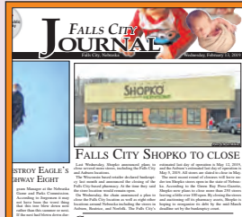
'Shopko closes its doors' Falls City Journal — Jan. 23 and Feb. 13, 2019