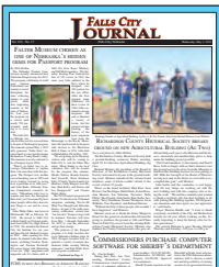
'RC Historical Society breaks ground' Falls City Journal May 1, 2019