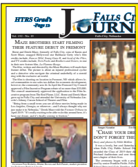
'Maze Bros start filming feature debut' Falls City Journal May 15, 2019