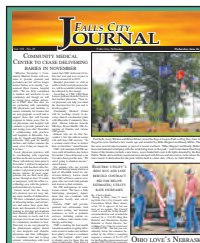
'CMC to cease delivering babies in Falls City' Falls City Journal June 26, 2019

Unexpected tornadoes touched down on Monday, May 21 near, Dawson, and included an EF3 tornado near the Nebraska-Kansas border, Richardson County officials tracked the storm that developed and dissipated nearly ten times. No major damage was reported with the tornado warned storm system that traveled from Bern, KS to Peru, NE and across the Missouri River. No watch was set in place prior to the tornadoes.