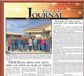
'F&M opens Harlan drive-thru' Falls City Journal — January 9, 2019

News-makers of 2019 has been split into two sections. The second section of stories will run in next week's paper.