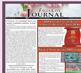
'2019 Nebraska Editorial of the year' Falls City Journal — April 10, 2019

Heavy rain and melting snow caused another round of historic flooding in Nebraska, Missouri and Iowa. Residents along the Missouri River were evacuated and the Rulo, Brownville and Nebraska City Missouri bridges were all closed for months. Fremont, NE left residents cut off from the world. Gov. Pete Ricketts said it was, "the most widespread flooding damage we've had in the last half century."