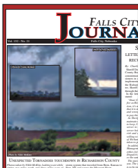
'Unexpected Tornado outbreak in R.C.' Falls City Journal May 30, 2019