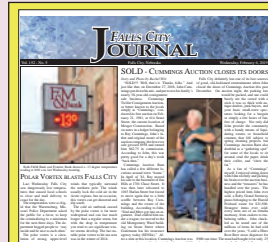
'Cummings Auction closes its doors' Falls City Journal — February 6, 2019

After much speculation, Shopko announced plans to close the Falls City and Auburn stores. The Wisconsin based retailer declared bankruptcy in January announcing the closing of the Falls City based pharmacy at that time. At the time of the announcement the chain planned to close eight other locations around Nebraska. The last day of operation was set to be May 12, 2019 with all Shopko stores due to close in May.