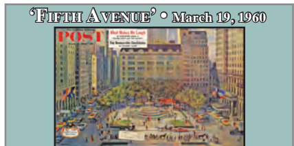
Fifth Avenue—showcase of fashion, hub of big industry, parade ground for visiting celebrities, home to the very rich. In her 135 blocks between Greenwich Village and Harlem are such landmarks as the Empire State Building, Rockefeller Center, St. Patrick's Cathedral and the Metropolitan Museum of Art—but nowhere is she quite so magnificent and vivacious as here at Fifth-ninth Street, gateway to Central Park. Between the sun-splashed windows of Tiffany's (left center) and the former figure of Eloise, gazing down from her perch at the Plaza (right), artist John Falter has captured a brilliant Saturday morning in April.