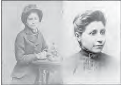
Susette and Susan La Flesche.