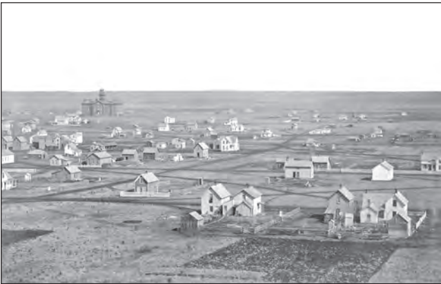
University of Nebraska, Lincoln, photographed from the tower of the state capitol in 1872.