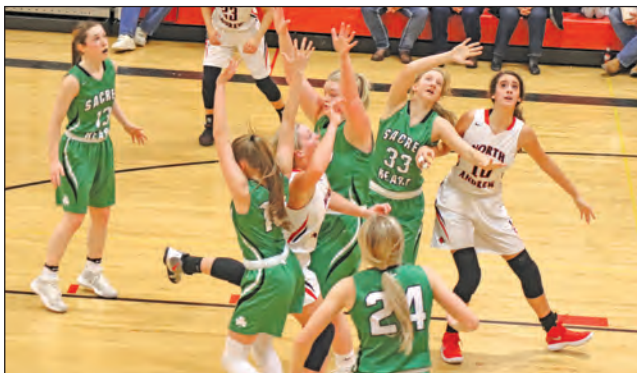
The North Andrew player tries to cut through the entire Irish defense.

The Irish will wrap up the regular season with the MUEDECAS finals on Monday night versus Class C2 #8 ranked Tri-County and then will host Lourdes Central on Saturday at the RAC with JV action tipping off at 5:00 p.m.