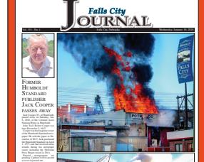
'FC business destroyed by fire' Falls City Journal — January 10, 2018

A massive fire tore through the 1500 block of Stone Street in Falls City's downtown area on January 3, destroying one local business and forcing several others to shut their doors for the day. No injuries were reported, but Potrillo's Mexican Restaurant sustained significant damage during the midmorning fire. The fire spread quickly from what was believed to be the basement of Portillos. Flames were as high as 15 feet tall at some points.