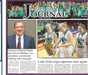
'Lady Irish reign supreme once again' Falls City Journal — March 7, 2018