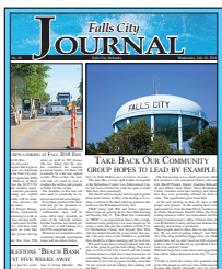
'Take Back Our Community' Falls City Journal July 18, 2018