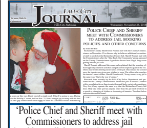
'Police Chief and Sheriff meet with Commissioners to address jail booking policies and other concerns' Falls City Journal — November 28, 2018