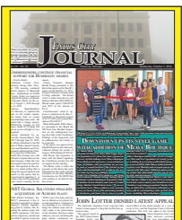
'Downtown ups its style with Miava Boutique' Falls City Journal October 3, 2018