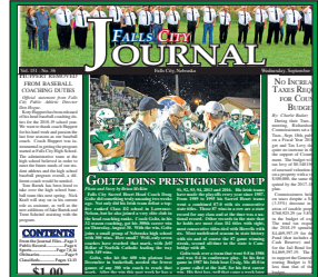
'Goltz joins prestigious group' Falls City Journal — September 12, 2018

The Falls City Journal moved to our new location of 1709 Stone Street after operating for nearly 62 years at our home at 1810 Harlan Street. Our current building formerly housed Clow Fitness and CRT, neighbors the Schulenberg Bakery and Sixpence. The main level is used to house staff while the lower level is used for collating and labeling newspapers on Tuesday mornings. The move began on May 1, 2018 and was completed within a week.