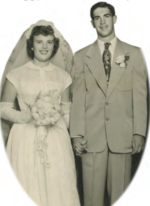
July 7, 1952

Grandchildren are the crowning glory of the aged; parents are the pride of their children. Proverbs 17:6